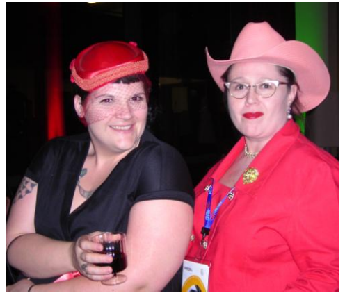
ATLFF 2010