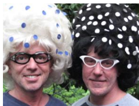
WIG OUT @ The Eagle, a benefit for MondoHomo