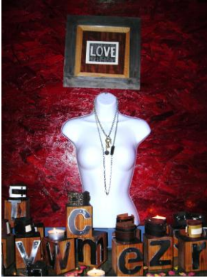
For The Love of Art Artists Market & Wine Tasting